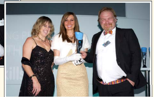
Special National Training Award