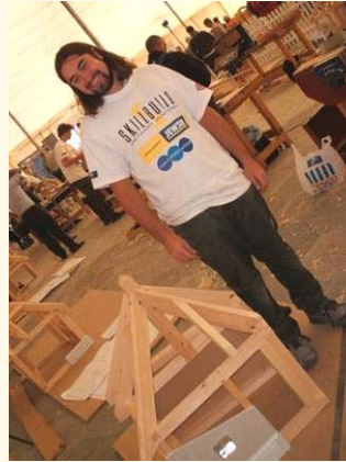
2005 Skill Build