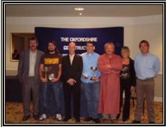
Oxfordshire Apprentice of the Year Awards 2005