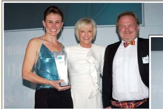
National Training Award